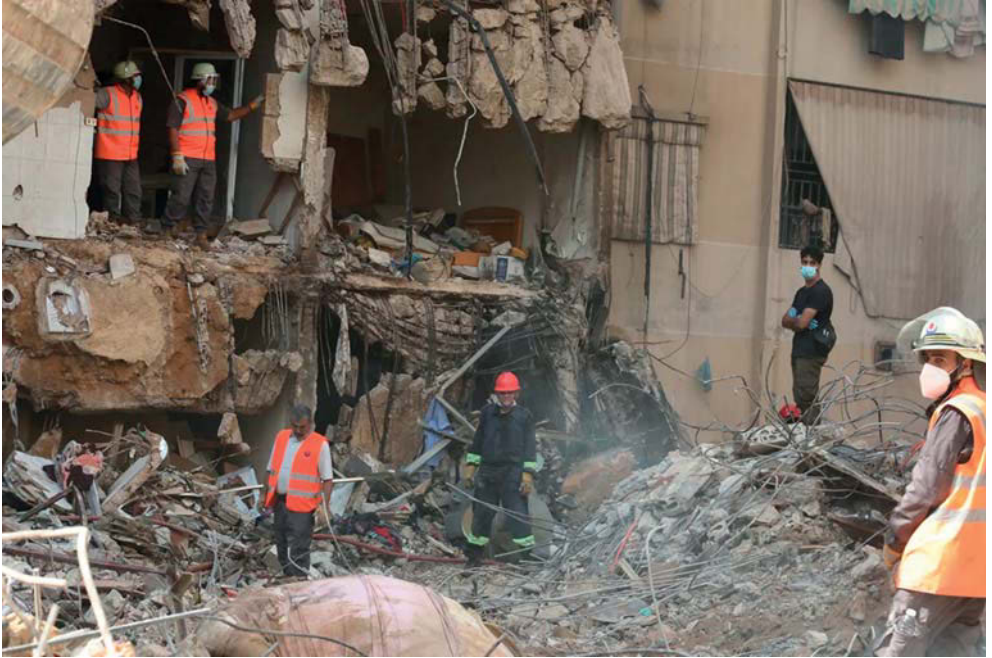
Beirut, September 2024: Rescue work after an Israeli air raid.

short, criminals of war offered themselves the gift of amnesty at the expense of their victims and their families. We have cultivated a culture of impunity.