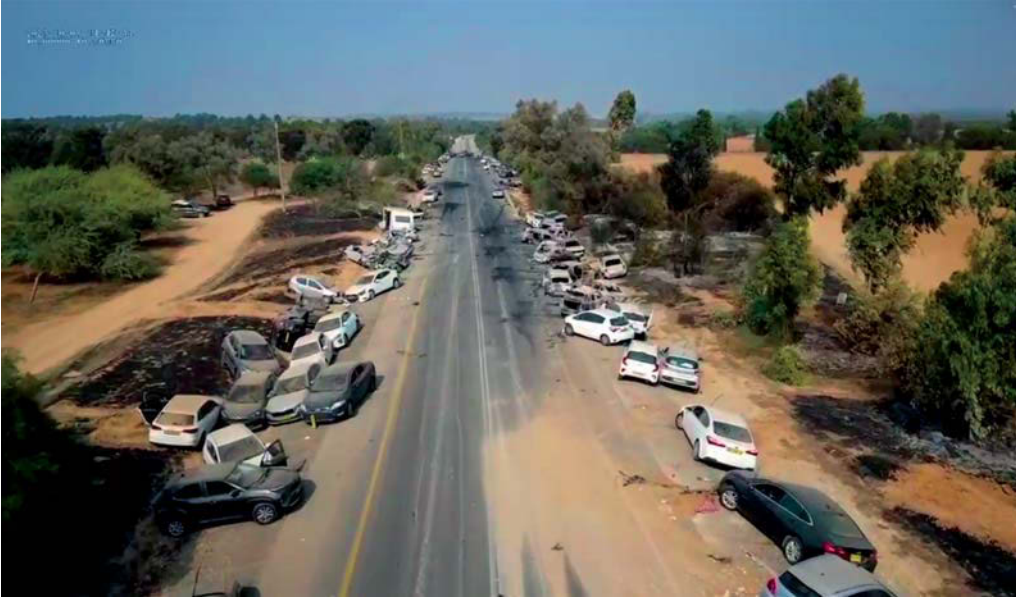
After the massacre on 7 October: cars left abandoned along the evacuation route

In recent years, I have been living in Germany and every Saturday there is a siren test. When I hear it, my heart skips a beat and I have to catch my breath.