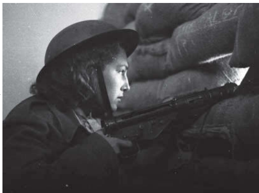
1948: The young state had to fight for survival in the Arab-Israeli war.