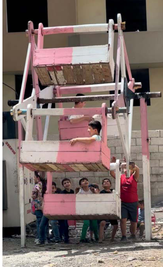
Children on a homemade swing in Tartous.

Professional psychological support is crucial for overcoming trauma. Unfortunately, access to mental health services in Syria is extremely limited. This makes community-based interventions all the more important. Peer support groups, where survivors share their experiences and offer each other compassion and understanding, have proven helpful in overcoming trauma.