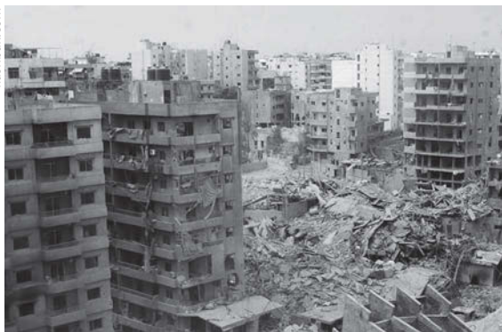
Beirut 1990: After the end of the civil war, entire city districts lay in ruins.

in Lebanon. But the pursuit of truth can never be denied. Jesus said to those who believed in him: “If you hold to my teaching, you are really my disciples. Then you will know the truth, and the truth will set you free” (John 8:31-32).