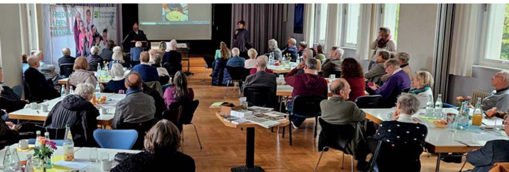
Everyone at the EVS General Meeting found the hospitality of the local congregation of St. Johannes in Ettlingen very refreshing.