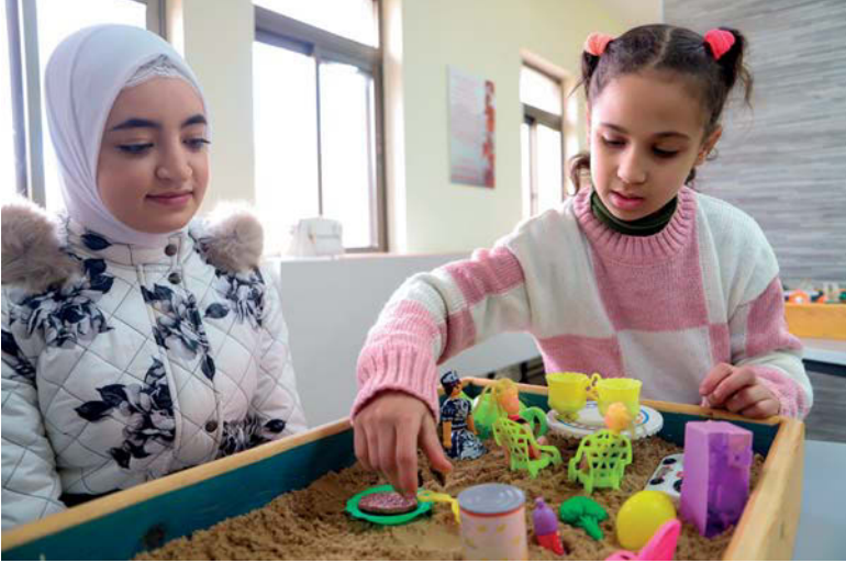
Children are able to process experiences of violence through play.

survivors who can rebuild their lives. Children are especially vulnerable to violence. In groups at the centre in Bethlehem, they learn they are not alone with their fears and difficulties and they are shown how to calm and stabilise themselves, for example through art, music and methods from play therapy.