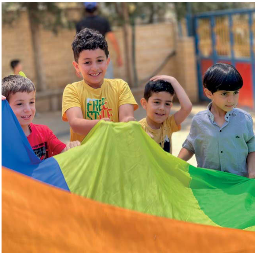
It takes many hands to move a full-size brightly coloured swing cloth.